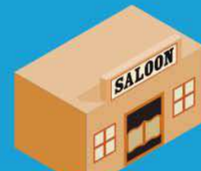
Saloon & Spa